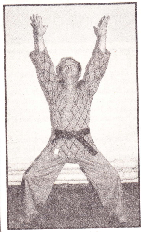
All three pictures are special breathing exercises developed in the martial art of hapkido. They are used to bring Ki from inside the body to the hands while strengthening stances and teaching students to breath with their lower abdomens.